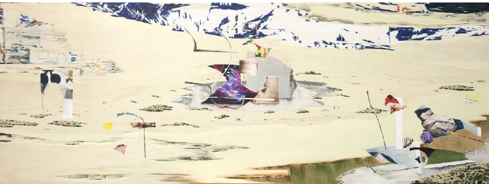
Yoon Ji-Eun La traverse II pencil, coloured pencils, acrylic and sculpture on wood 56 x 149 cm 2023 JEY.2023.009