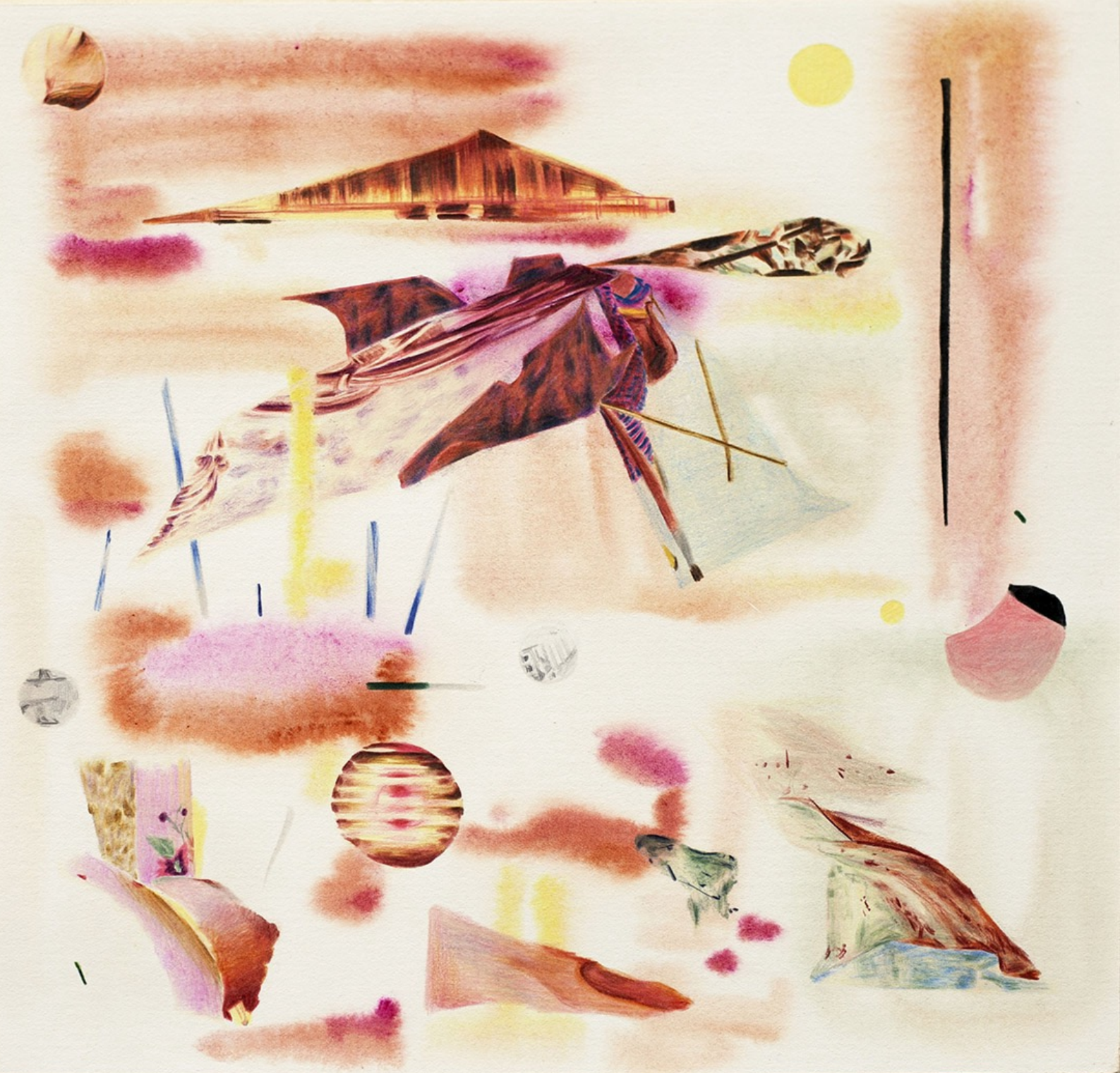
Yoon Ji-Eun Reflets de lune coloured pencils and watercolor on paper 26,7 x 27,7 cm 2023 JEY.2023.016