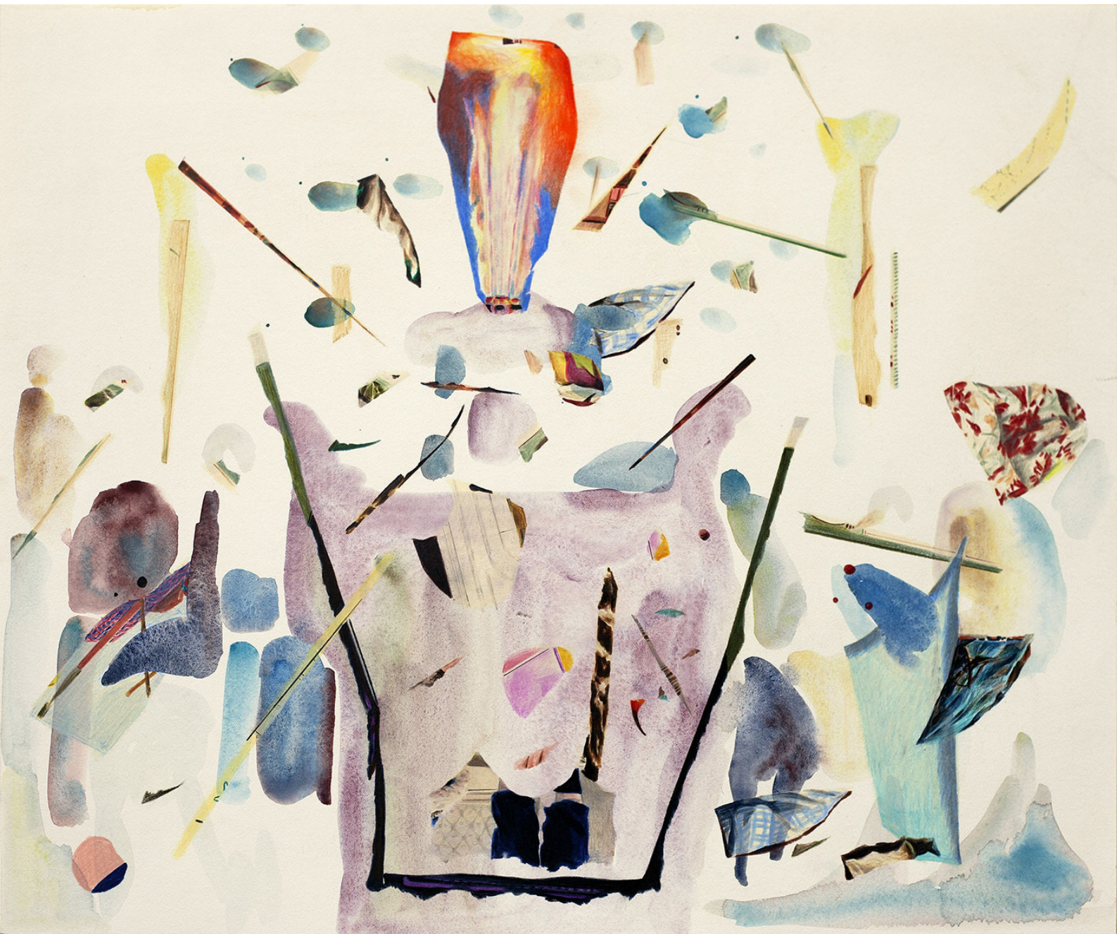
Yoon Ji-Eun Les éclairs coloured pencils and watercolor on paper 38 x 46 cm 2023 JEY.2023.011