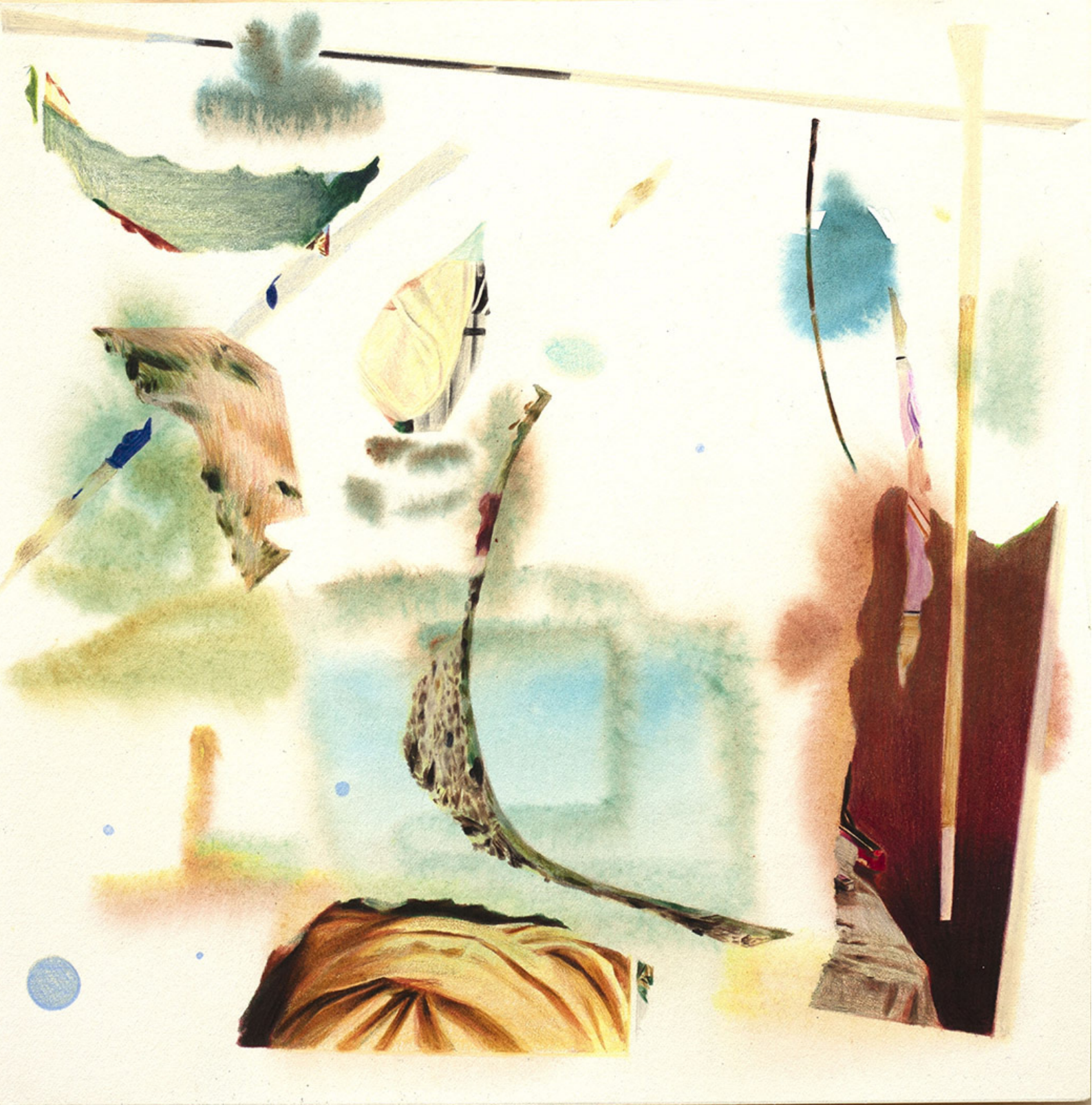
Yoon Ji-Eun Le temps balance coloured pencils and watercolor on paper 27 x 27 cm 2023 JEY.2023.015