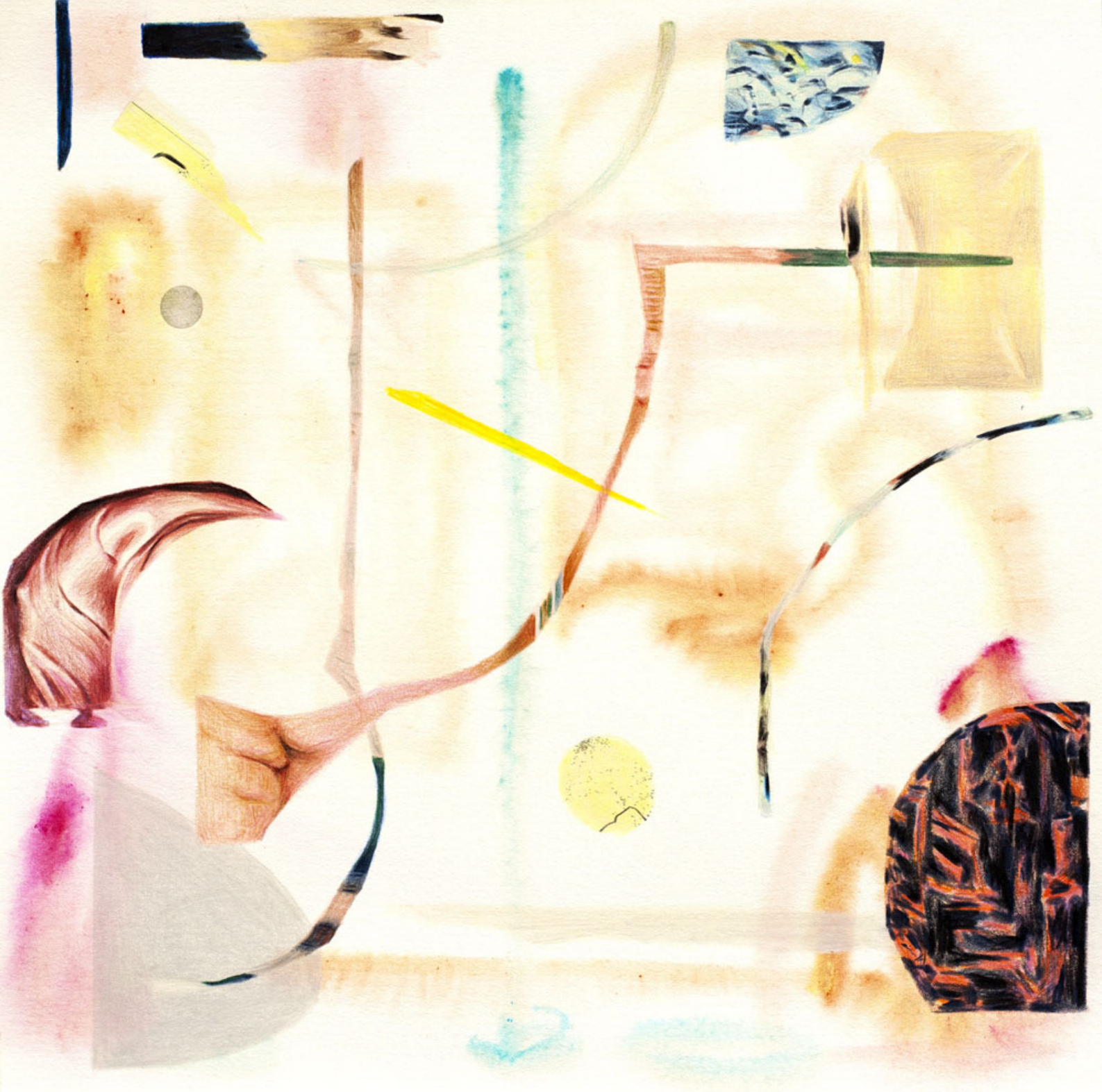
Yoon Ji-Eun 2nd day coloured pencils and watercolor on paper 27 x 27 cm 2023 JEY.2023.006