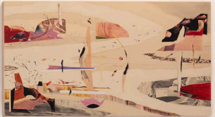
Yoon Ji-Eun – Unanswered questions exhibition view