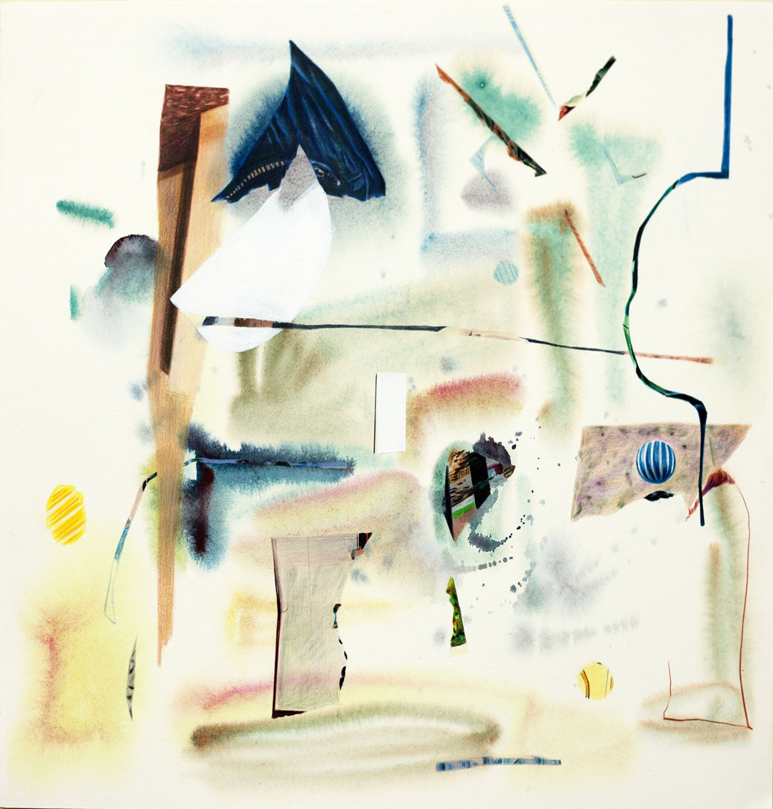
Yoon Ji-Eun Une écorce coloured pencils and watercolor on paper 48,8 x 41 cm 2023 JEY.2023.010