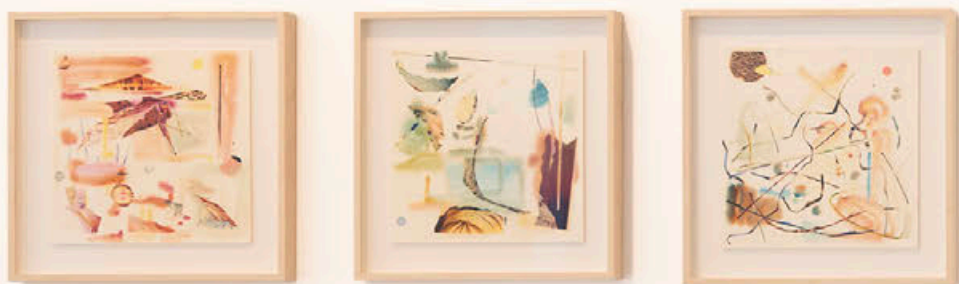
Yoon Ji-Eun – Unanswered questions exhibition view