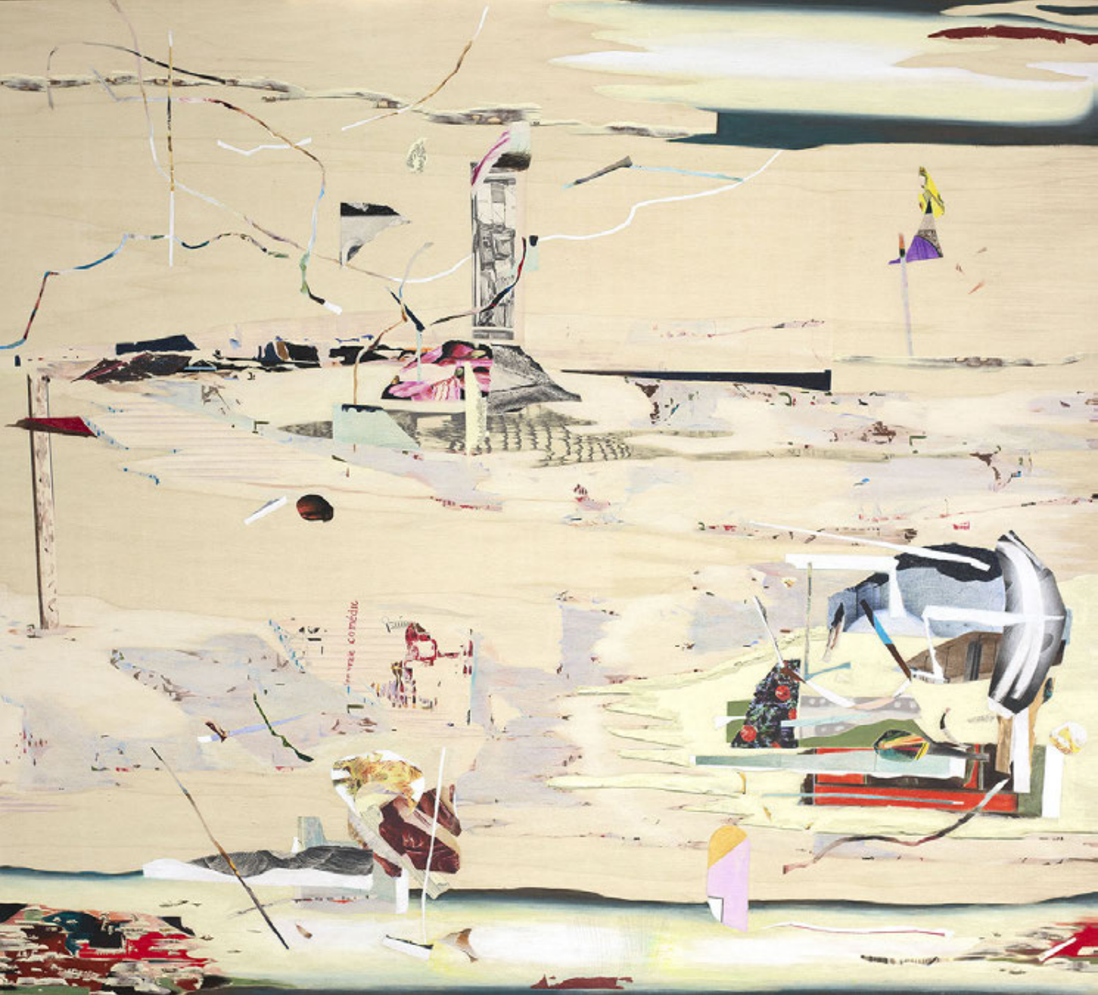
Yoon Ji-Eun L'heure d'embarquement coloured pencils, acrylic and sculpture on wood 122 x 134,5 cm 2024 JEY.2024.004