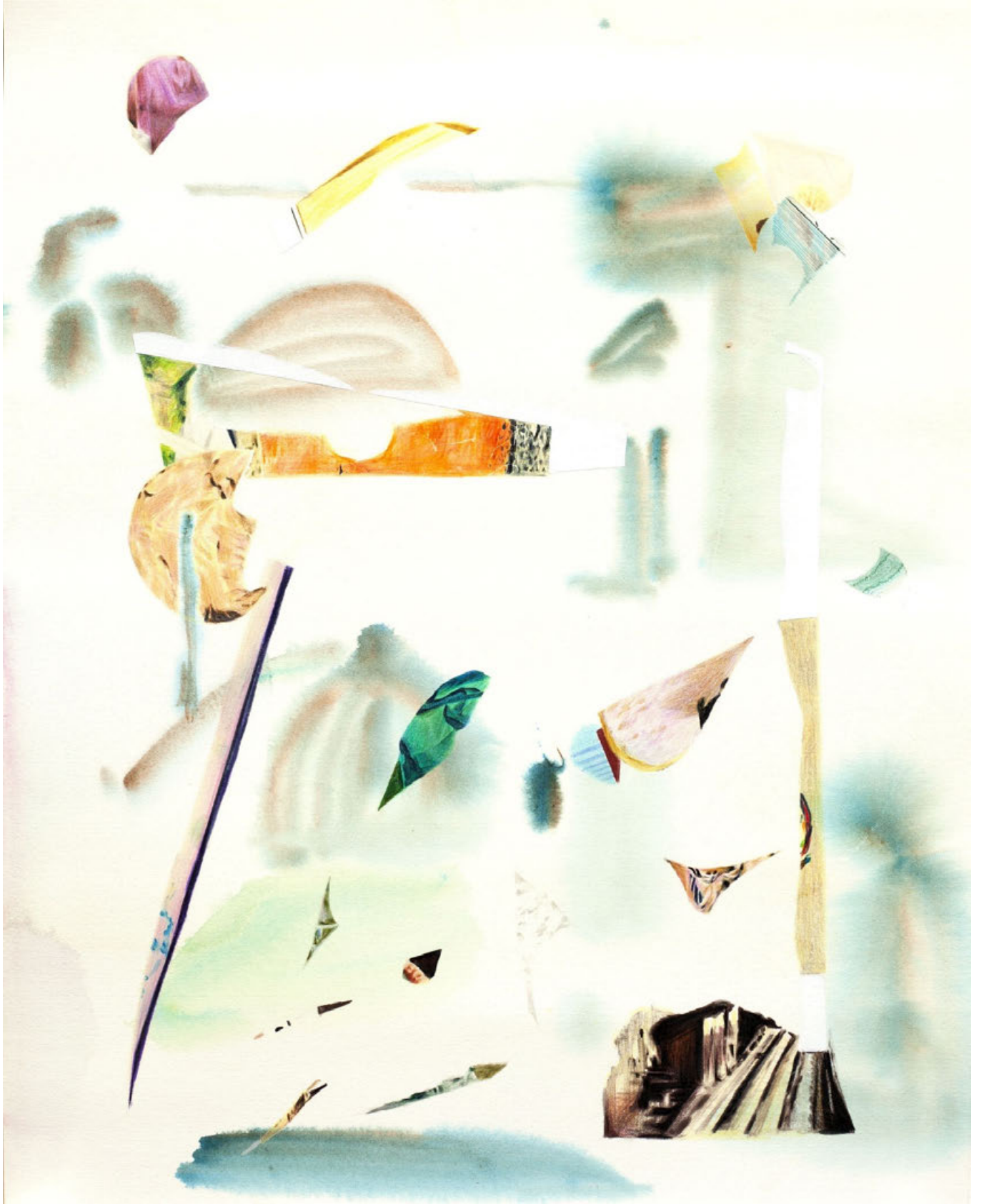
Yoon Ji-Eun Un bout de chemin coloured pencils and watercolor on paper 50 x 40 cm 2023 JEY.2023.004