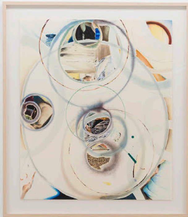
Yoon Ji-Eun – Unanswered questions exhibition view