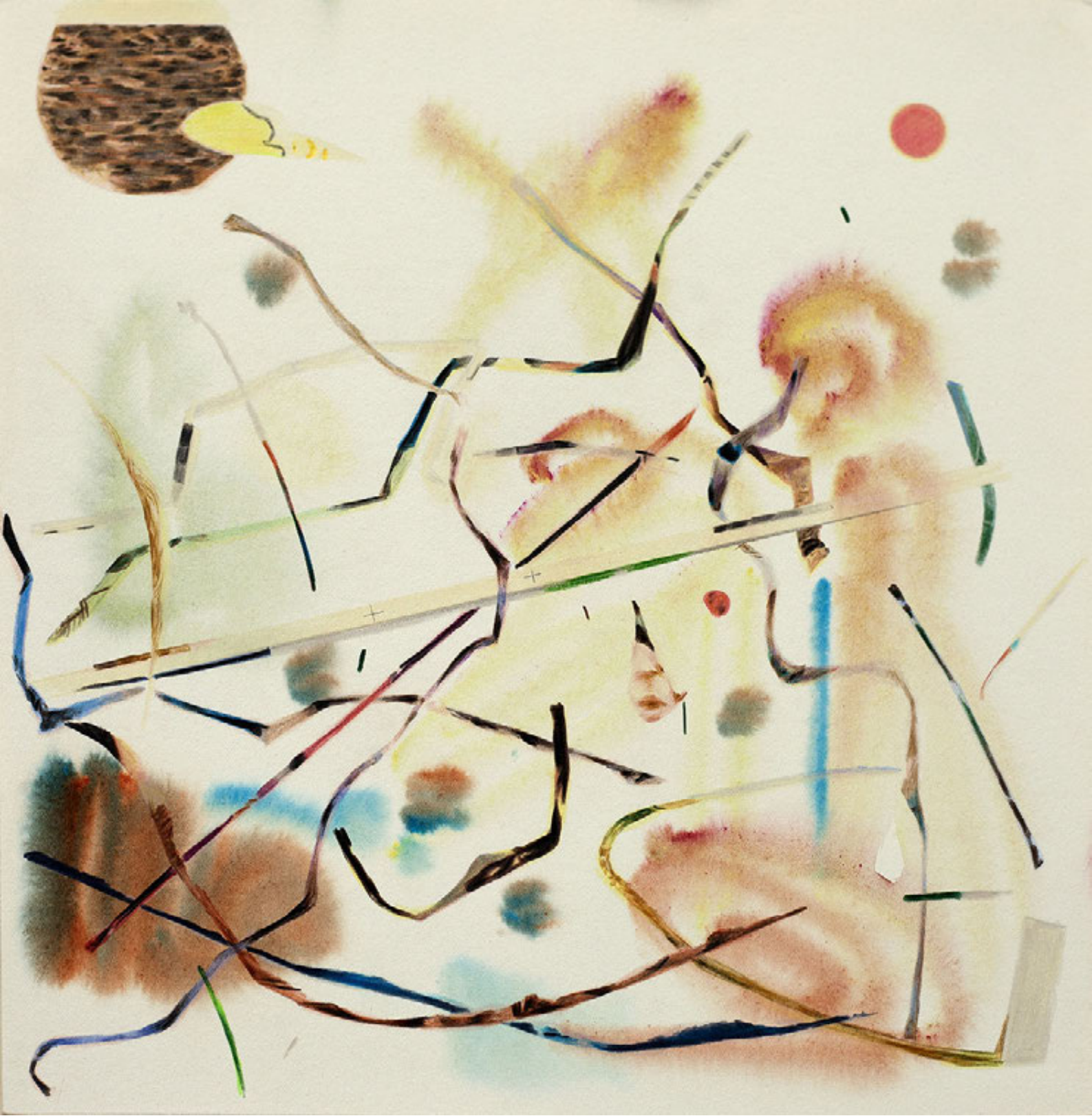
Yoon Ji-Eun Le bout de fils coloured pencils and watercolor on paper 28 x 27 cm 2023 JEY.2023.014