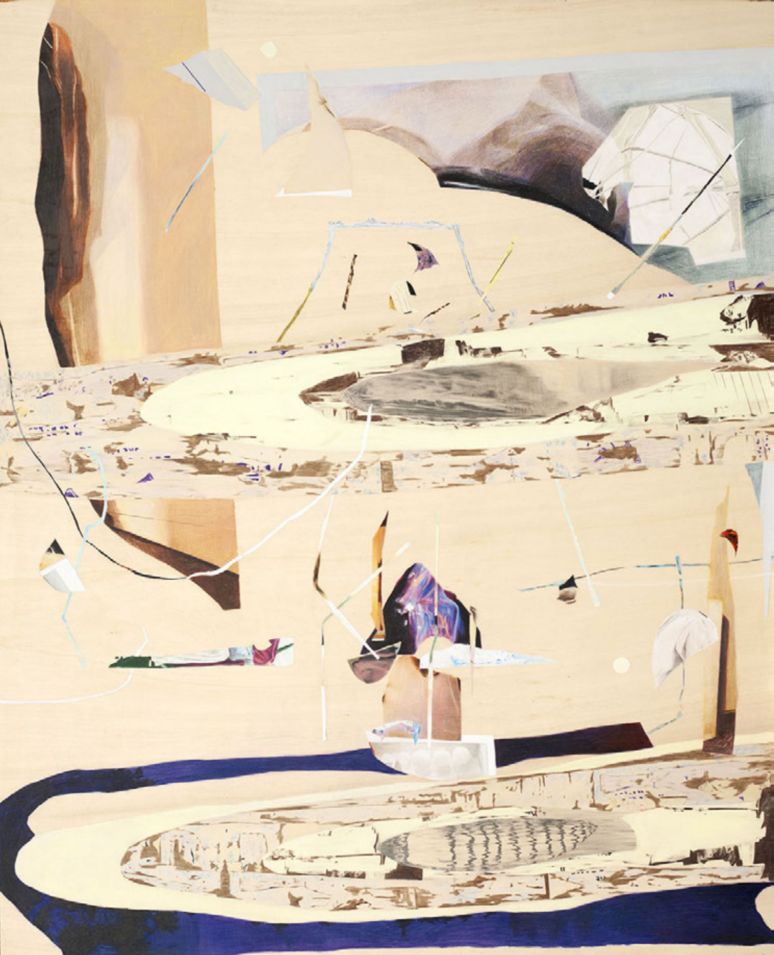
Yoon Ji-Eun Déjà vu coloured pencils, acrylic and sculpture on wood 121,8 x 98,7 cm 2023 JEY.2023.005