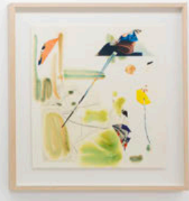
Yoon Ji-Eun – Unanswered questions exhibition view