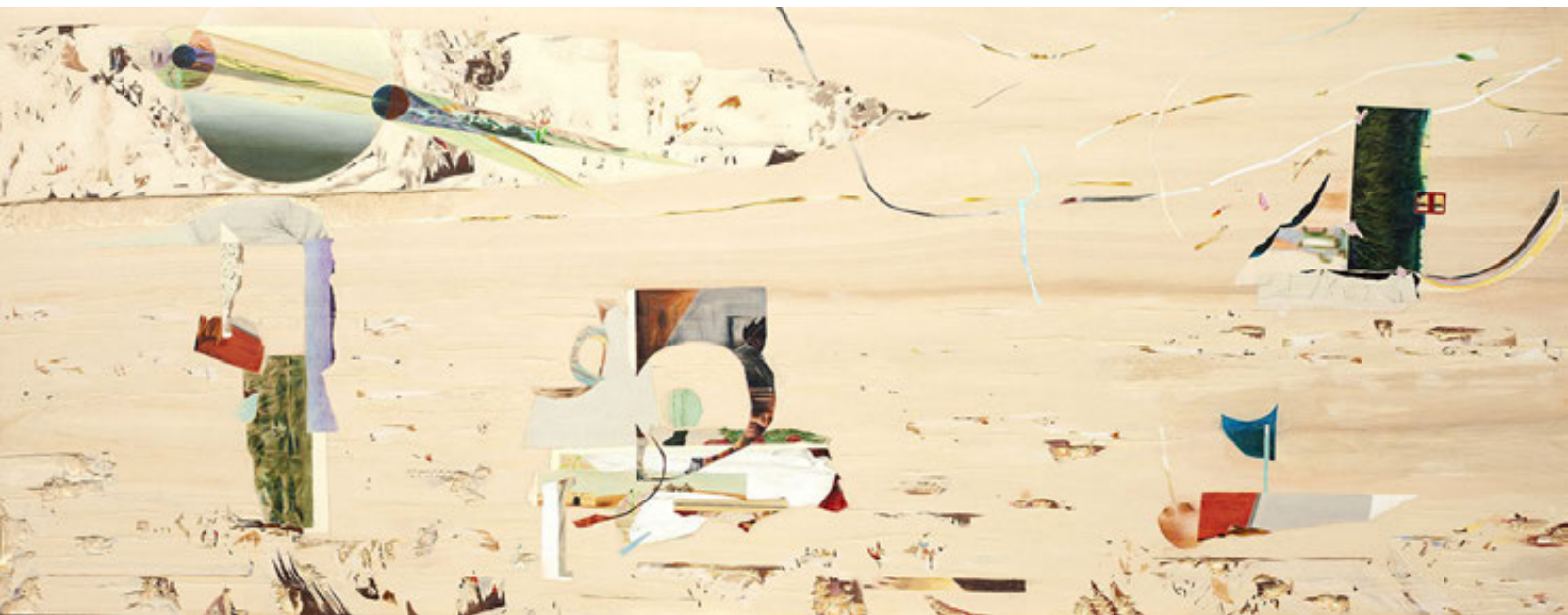
Yoon Ji-Eun La traverse pencil, coloured pencils, acrylic and sculpture on wood 60,7 x 155,8 cm 2023 JEY.2023.008