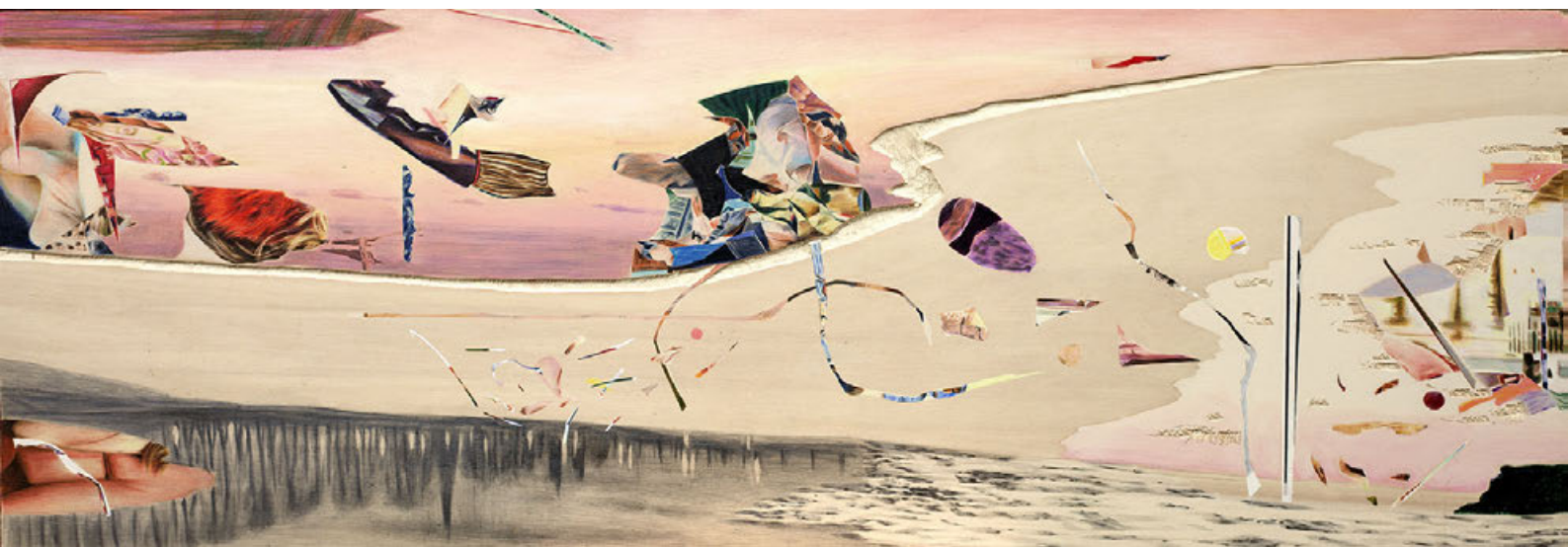
Yoon Ji-Eun A l'aube du jour coloured pencils, acrylic and sculpture on wood 37 x 106,5 cm 2024 JEY.2024.001