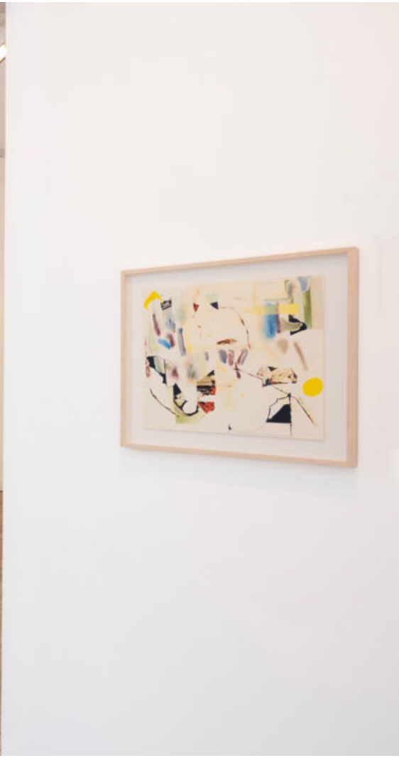
Yoon Ji-Eun – Unanswered questions exhibition view