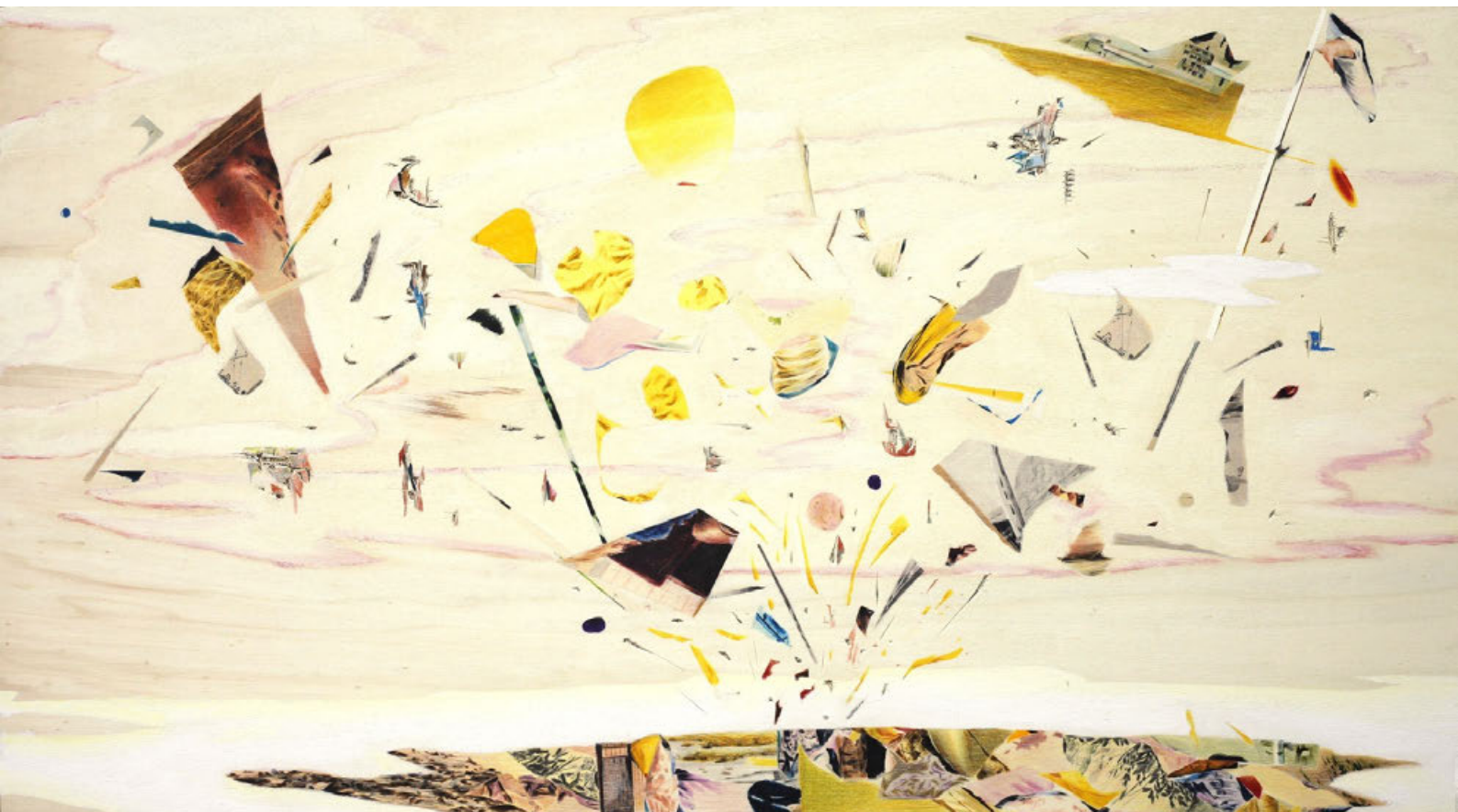
Yoon Ji-Eun Déploiement coloured pencils, acrylic and sculpture on wood 64,5 x 115,5 cm 2023 JEY.2023.001