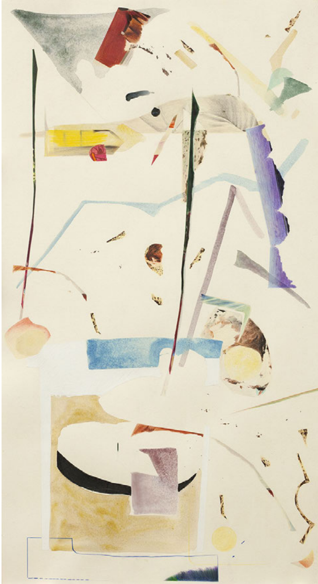
Yoon Ji-Eun Un extrait coloured pencils and watercolor on paper 80,8 x 45 cm 2023 JEY.2023.017